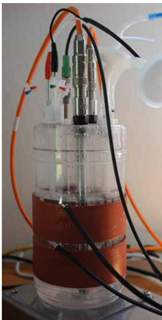
CerCell offer slim line 50x380 mm silicone heating blanket, which fits OD130, 150, 200 mm CellVessel and BactoVessel. Power rated at 110 watt from 48, 110 or 230 VAC supply.