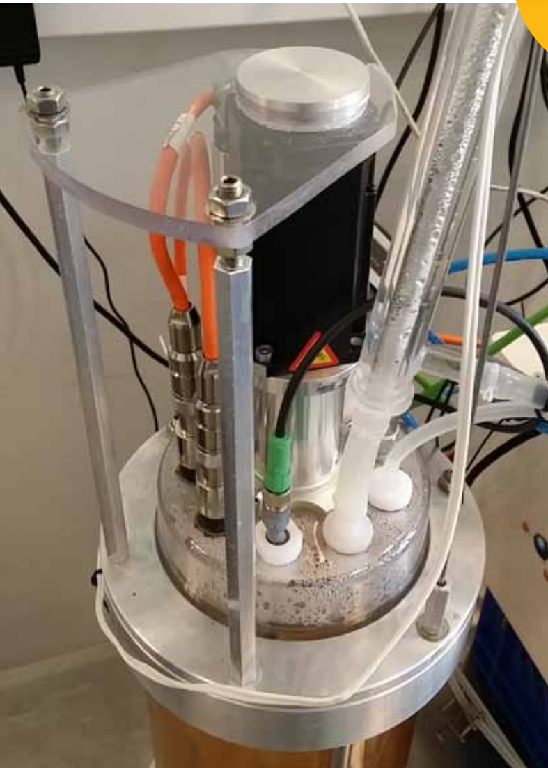
CellVessel 5.7 litre with two Marine impellers operating at 500 RPM mounted in Re-Usable-Jacket, equipped with servo motor support, Sky-Support for the gas-cooler and exhaust filter, digital sensor package.