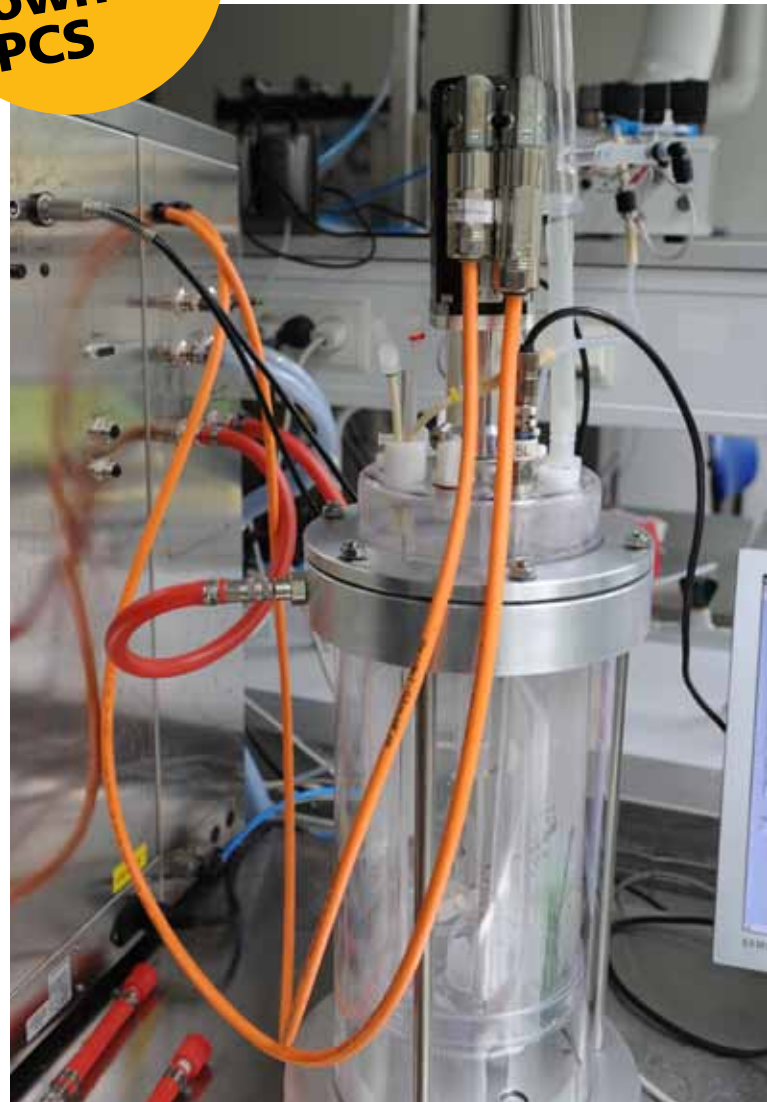
Kollmorgen AKM23D servo motor driving via HPD in Biostat PCS setup a 5.7 litre CellVessel submerged in a RUJ. Hot stuff to comprehend the sometimes very warm water supplied from water heating PCS!