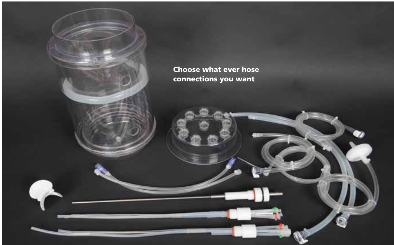
Shown a few of the 4,000 different components from the Configurator Tool able to satisfy any request