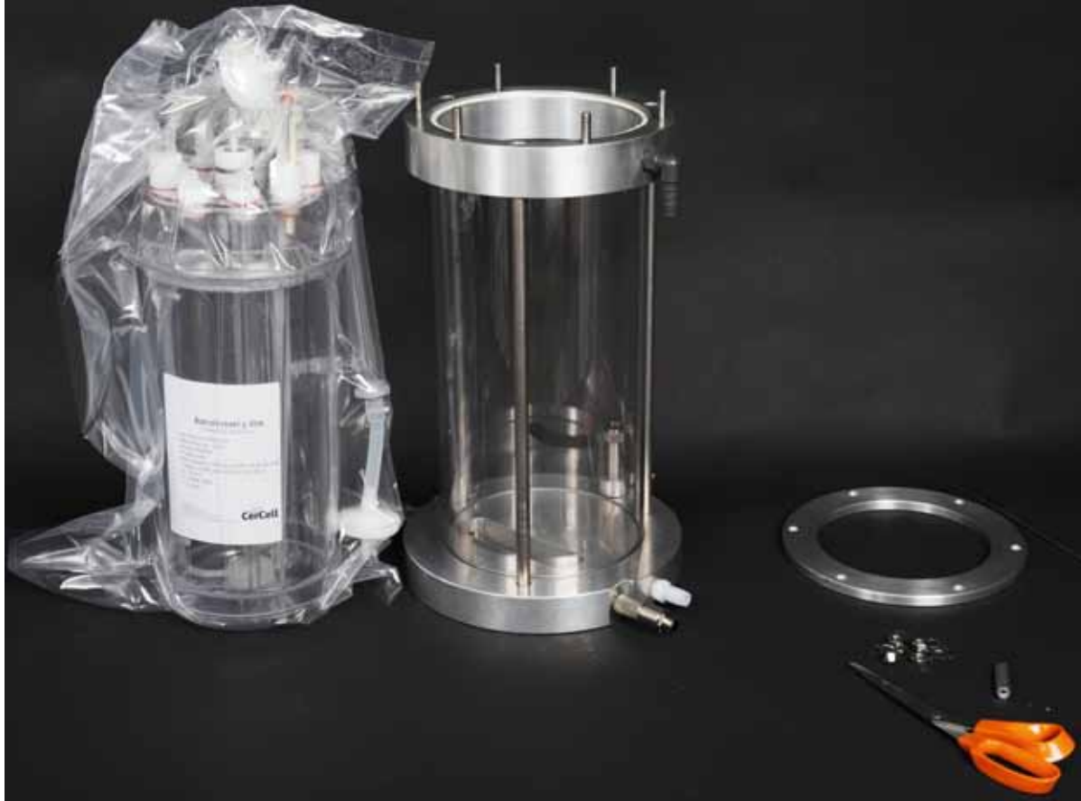
Customised 5.7 litre SUB for Head-Plate-Drive next to the Re-Usable-Jacket for heating prior the installation.