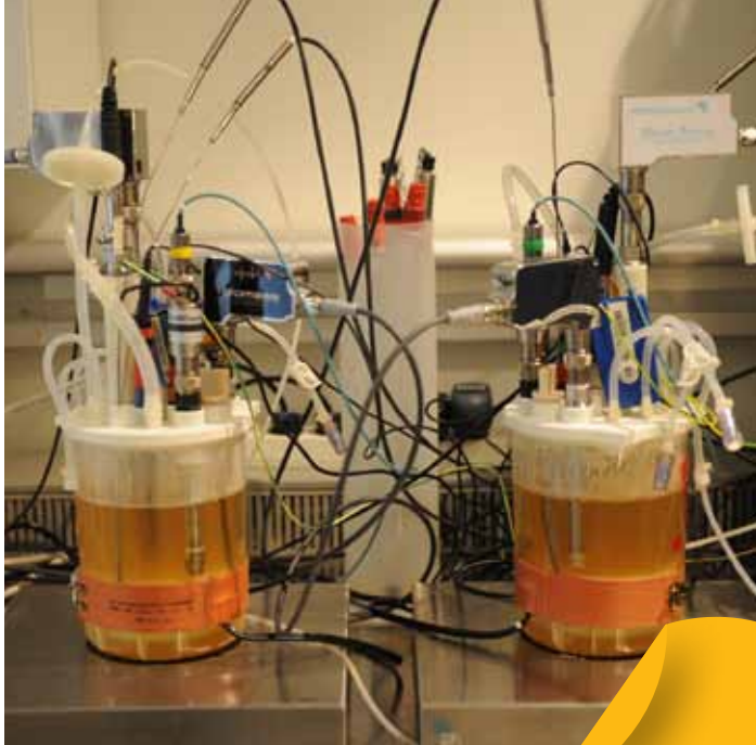
Two identical 2 litre SUB on Magnetic-Stirrer-Tables equipped with 50x380 mm silicone heating blanket. Power rated at 110 watt from 230 VAC supply.