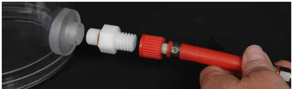
CellVessel equipped with Single-Use-Jacket and female G3/8" threaded connections for a variety of adapters. Photo shown here with G3/8" on SUB to GL18 adaptor (in white) for red Biostat hose connection.