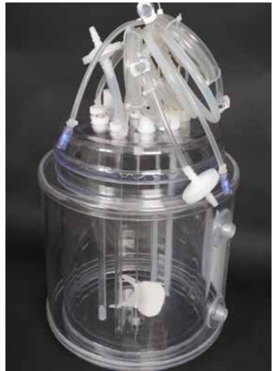
16.4 litre VV CellVessel (OD250x320) via Configurator Tool equipped with SUJ. The two female threaded G3/8" connections are visible on the right side of the SUJ.